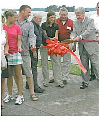
Photos: Riverwalk Construction; Completed Riverwalk Community Cleanup Day; Ribbon Cutting Ceremony