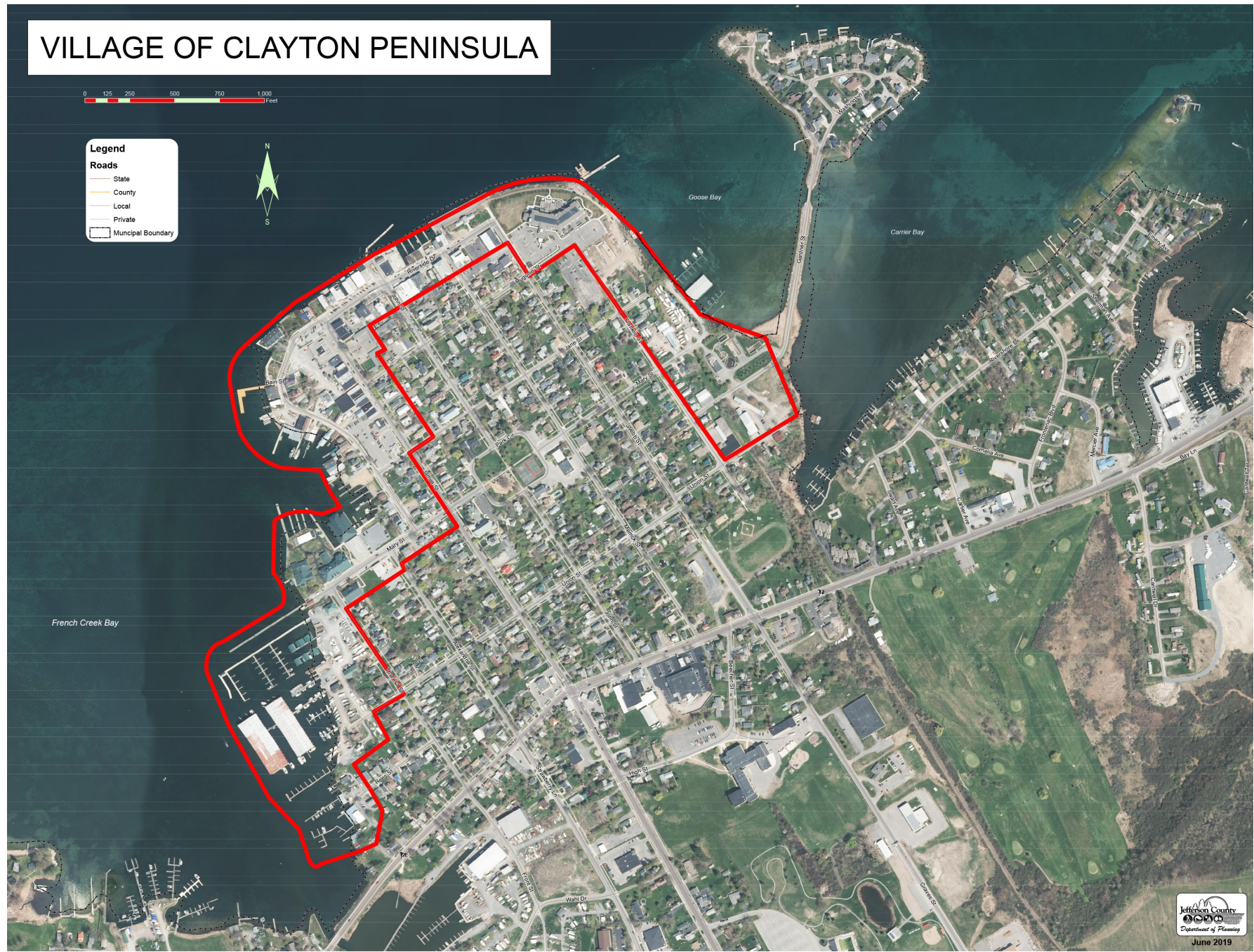
Proposed Downtown Target Area Outlined In Red